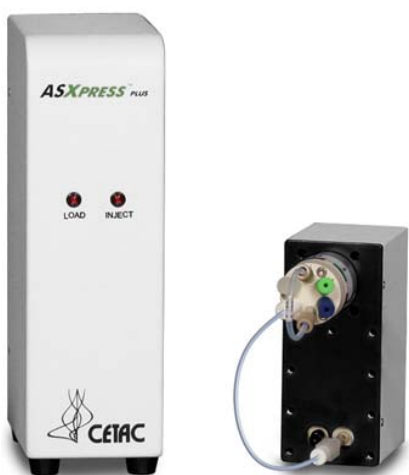
Figure 1. ASXPRESS® PLUS Rapid Sample Introduction System

The CETAC ASXPRESS® PLUS Rapid Sample Introduction System, when coupled to a CETAC autosampler, optimizes sample introduction by significantly increasing sample throughput and reducing costs of materials, power, maintenance and labor for ICP-MS analysis. The system is designed to allow multiple functions to occur simultaneously which would otherwise take place separately.